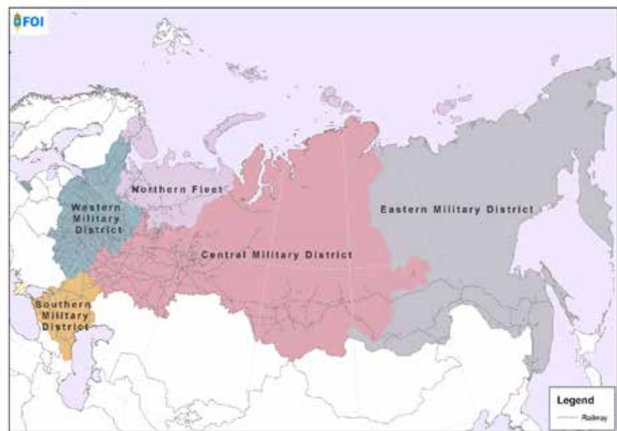
Map 1 - Russia's Military Districts and Joint Strategic Commands in 2017.

Russia's annual strategic exercises rotate between Military Districts. In 2010, the number of Military Districts was reduced from six to four: the Eastern, Central, Southern, and Western Districts. In December