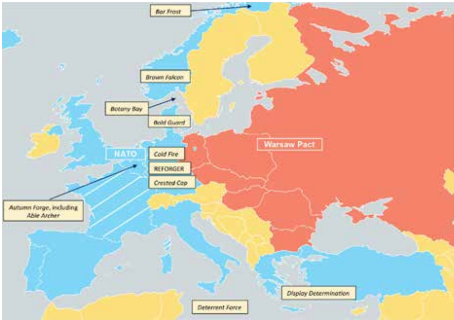
Figure 1. Principal, recurrent exercises in the Autumn Forge exercise series, 1975 – 1989.

France was not a participant in NATO's integrated military structure between 1966 and 2009. Spain joined NATO in 1982 but, initially, not its military structure. Accordingly, neither French, nor Spanish, forces took part in the Autumn Forge exercise series.